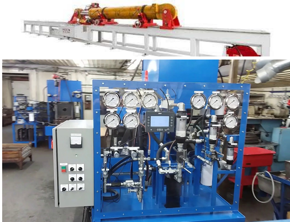
Fig.: Hydraulic Power Unit and Cylinder Stand for the Electro-Hydraulic Cylinder Test Rig