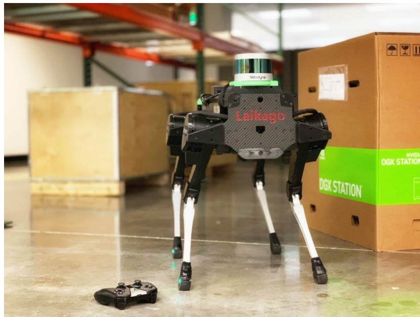
Fig.: Navigation Feedback control for the 4 Legged Robot Locomotor based on the LiDAR Technology